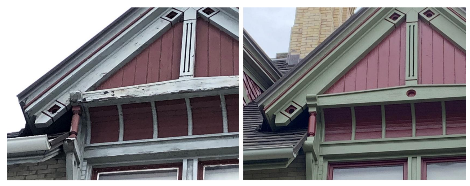
Dramatic before and after of new millwork and paint on third story.

For more pictures relating to this story, please contact <u>tweiland@hearthstonemuseum.org</u>